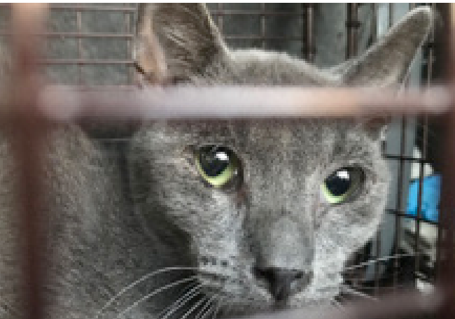
Day-in and day-out, Stray Cat Alliance is rescuing cats and kittens like this community cat, getting them spayed or neutered, providing medical care when necessary and then returning them to the streets (where allowed) or finding an adoptive home.